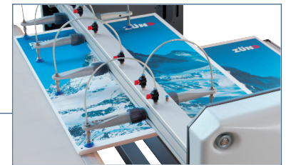
Automatic feeding of sheets and boards